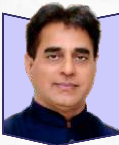
Shri Prafulbhai Pansheriya

Hon'ble Minister of Health and Family Welfare Government of Gujarat