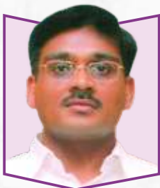
Shri Dhananjay Dwivedi

Hon'ble Minister of Health and Family Welfare Government of Gujarat