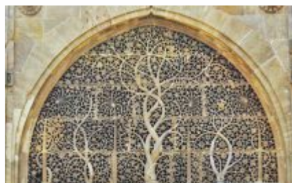
Sidi Saiyyed Mosque